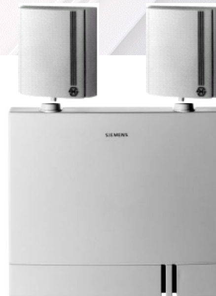
2 x Antenna SPA1900/70/8/0/CP

Cable example: RG223 / 2m / TNC-male / TNC-male Ordernr.: HUS00051